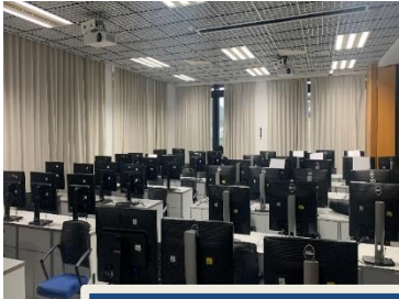
6 Computer Rooms