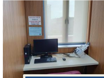
Optical Mark Recognition (OMR) Room