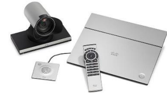
Video Conferencing Room