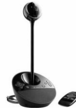
Speakerphone & Webcam